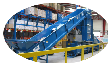
OPTION: CONVEYOR BELT