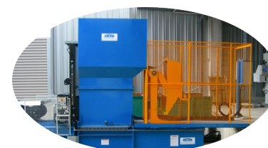
OPTION: BIN LIFTER

We reserve the right to make changes to specifications without prior notice. Bale weights are dependent upon material type.